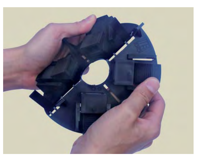
VersiPave® and VersiPave® Extenders can be sectioned for use along edges and corners