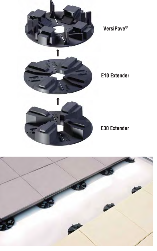
VersiPave® supporting pavers

VersiPave® has a height range of 25 mm to 35 mm and is easily extended up to 150 mm using proprietary E10 and E30 VersiPave® Extenders.